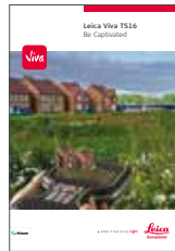
Leica Viva TS16

Illustrations, descriptions and technical data are not binding. All rights reserved. Printed in Switzerland – Copyright Leica Geosystems AG, Heerbrugg, Switzerland, 2015. 841871en – 10.15 – INT