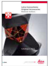
Leica Original Accessories