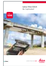
Leica Viva GS14