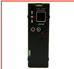
Pulse Laser Detector