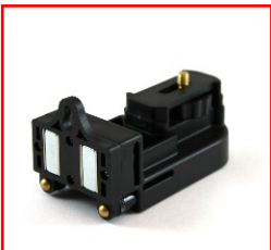
Magnetic Wall Mount