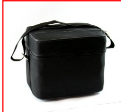
Soft Protective Case