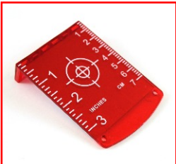
Magnetic Ceiling Mount