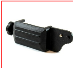
Laser Detector Clamp