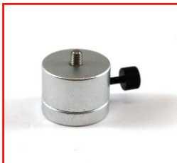
Universal Tripod Mount