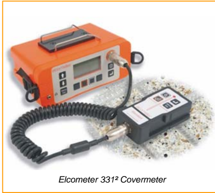
Elcometer 331 2 Covermeter

This easy to use gauge quickly and accurately locates, orientates and measures the depth of cover over reinforcement bars.