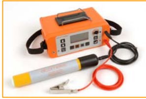
Elcometer 3312 with Half-Cell and stainless steel

Elcometer 3312 Covermeters with Half-Cell allow users to not only identify the location, orientation, depth and diameter of stainless steel rebar, but also the potential for corrosion all in one easy-to-use gauge.